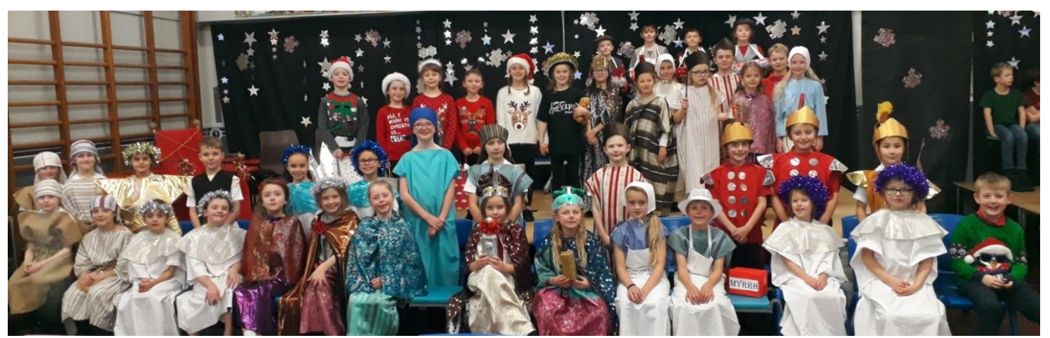
Years 3 & 4 in their costumes ready to perform 'The Magical Jigsaw'