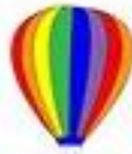
Hot air balloons