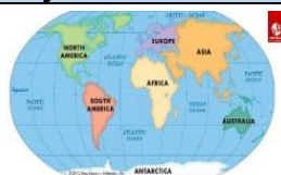
Continents/ Oceans of the World

There are 7 continents of the world and these include Antarctica, North America, South America, Asia, Europe, Africa and Australia/Oceania.