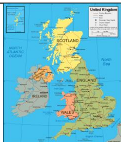
The United Kingdom

During this unit, the children will begin to consider transportation around the World.